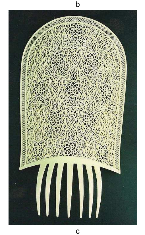
Figure 1 a,b,c, Celluloid combs, Auguste Bonaz, ca.1920.