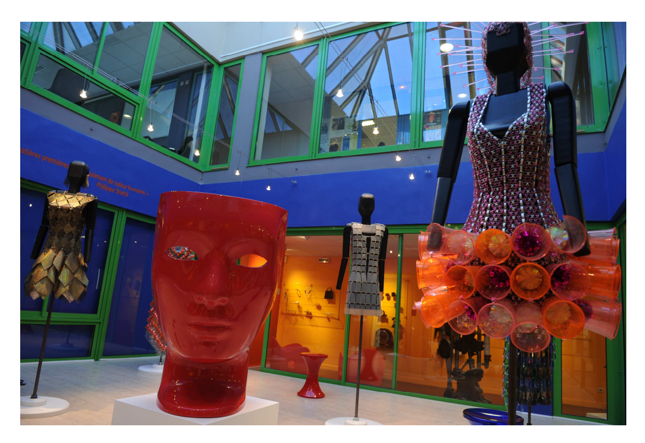
Figure 3 Poster of the 'Museum of the Comb and Plastics Industry', Oyonnax.